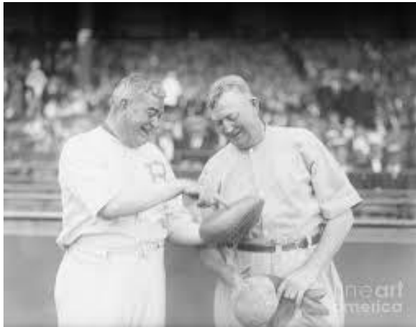
Duke Farrell and Cy Young

Disable INJURIES OFF, all injuries are for current game only, disregard the number of days it says.