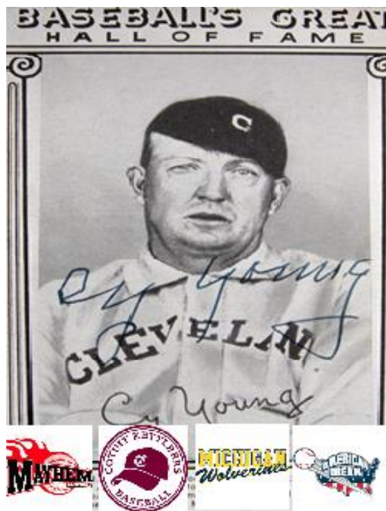
Denton True “Cy” Young