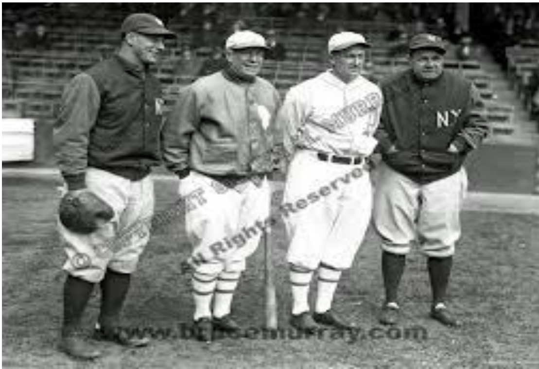
Gehrig, Speaker, Cobb, Ruth

Trading ends after game 72 and resumes after the season.