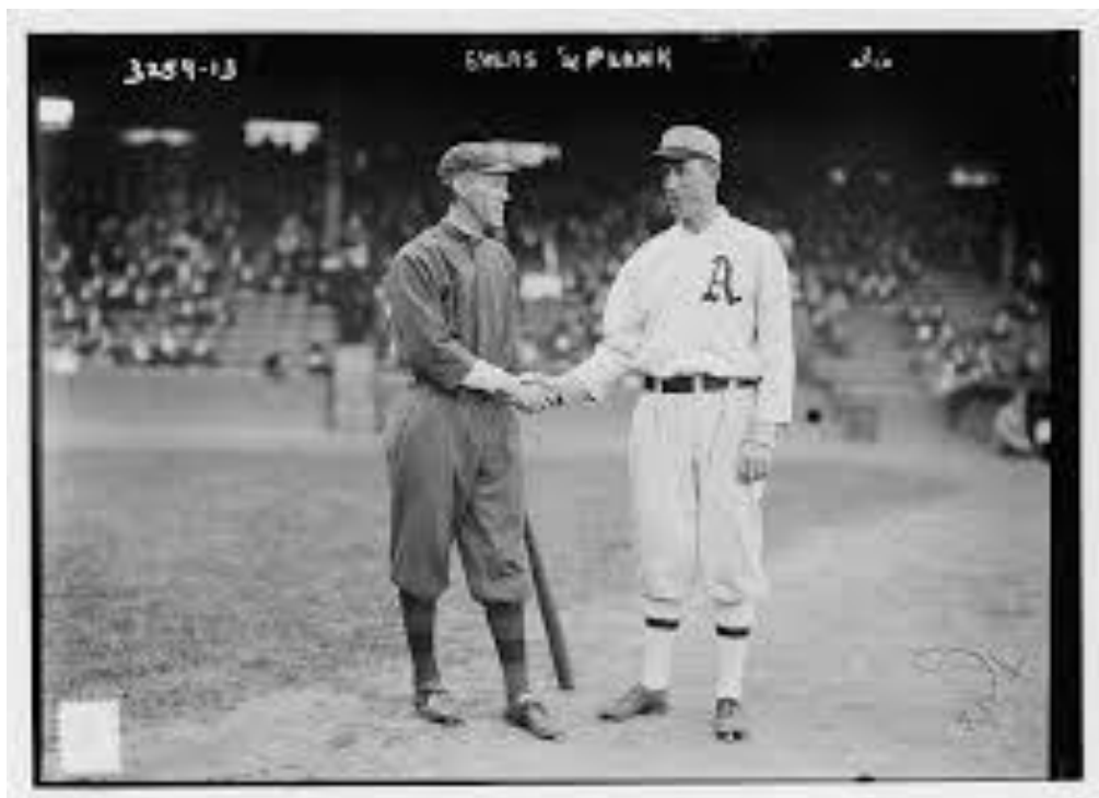
Evers and Plank

ALL penalties are at the commissioner's discretion.