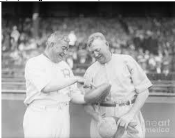
Duke Farrell and Cy Young

Speed of play: the goal is 2-3 series per week.